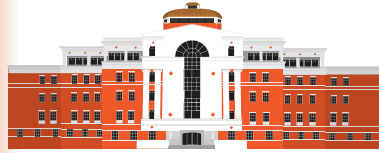
Lowder Hall, home of Harbert College of Business academic advising and the Office of Professional & Career Development.