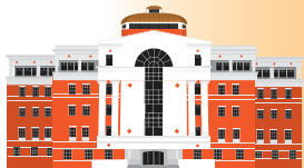
Lowder Hall, home of the Office of Professional & Career Development

With minimum education of a B.S.B.A., graduates reported an average entry level salary range of 43.5 - 54.K. This would include graduates working a wide range of jobs, including operating a family-owned business, managing a startup company, or owning and operating a franchise.