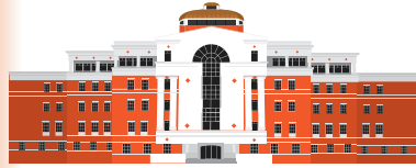
Lowder Hall, home of Harbert College of Business academic advising and the Office of Professional & Career Development.