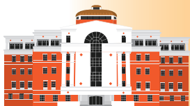
Lowder Hall, home of the Office of Professional & Career Development

ENTRY LEVEL SALARY RANGE: $52.2K - $65.2K