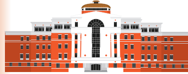
Lowder Hall, home of Harbert College of Business academic advising and the Office of Professional & Career Development.