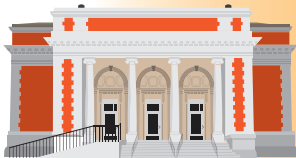
Mary Martin Hall, home of the Auburn University Career Center

These are just three options out of many that pre veterinarian majors pursue. For more career options be sure to check out "What Can I Do With a Major In..." on auburn.edu/career .