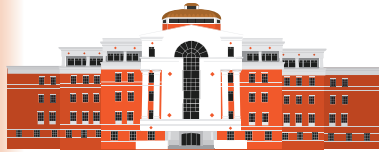
Lowder Hall, home of Harbert College of Business academic advising and the Office of Professional & Career Development.