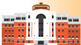
Lowder Hall, home of the Office of Professional & Career Development

ENTRY LEVEL SALARY RANGE: $44.5K - $65.7K